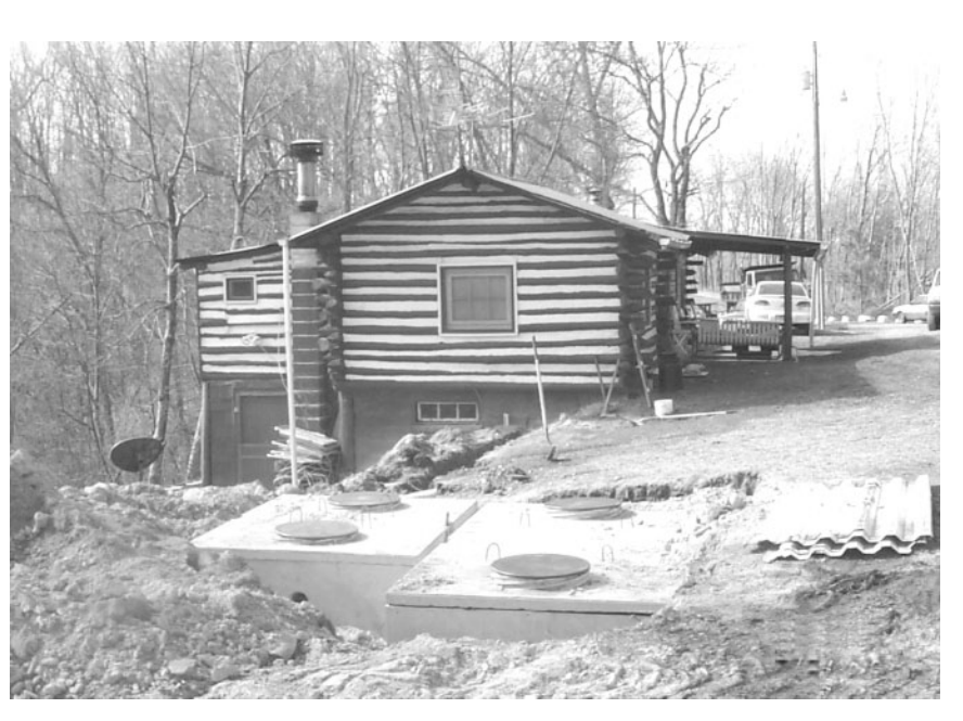
Problems with this West Virginia septic system have been going on for more than two years. During this time, the system has remained uncovered, creating much distress for the homeowners.

The contents of this newsletter do not necessarily reflect the views and policies of the U.S. Environmental Protection Agency, nor does the mention of trade names or commercial products constitute endorsement or recommendation for use.