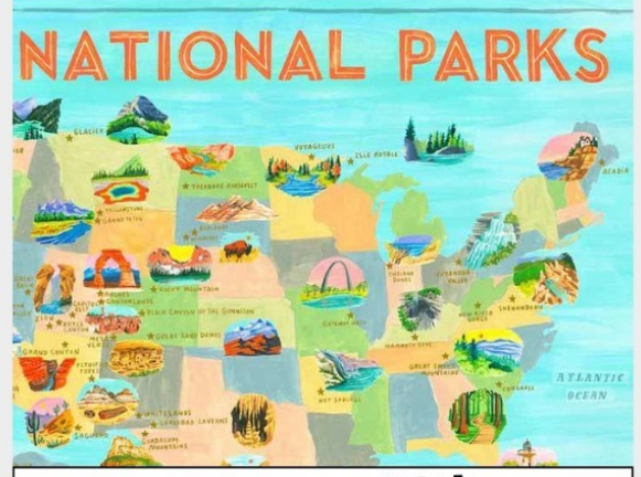
February 15th 6:30pm