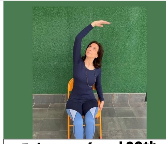
February 6 and 20th

Chair yoga increases flexibility, strength, and balance while boosting your mood, and reducing stress and joint strain. Registration Required.