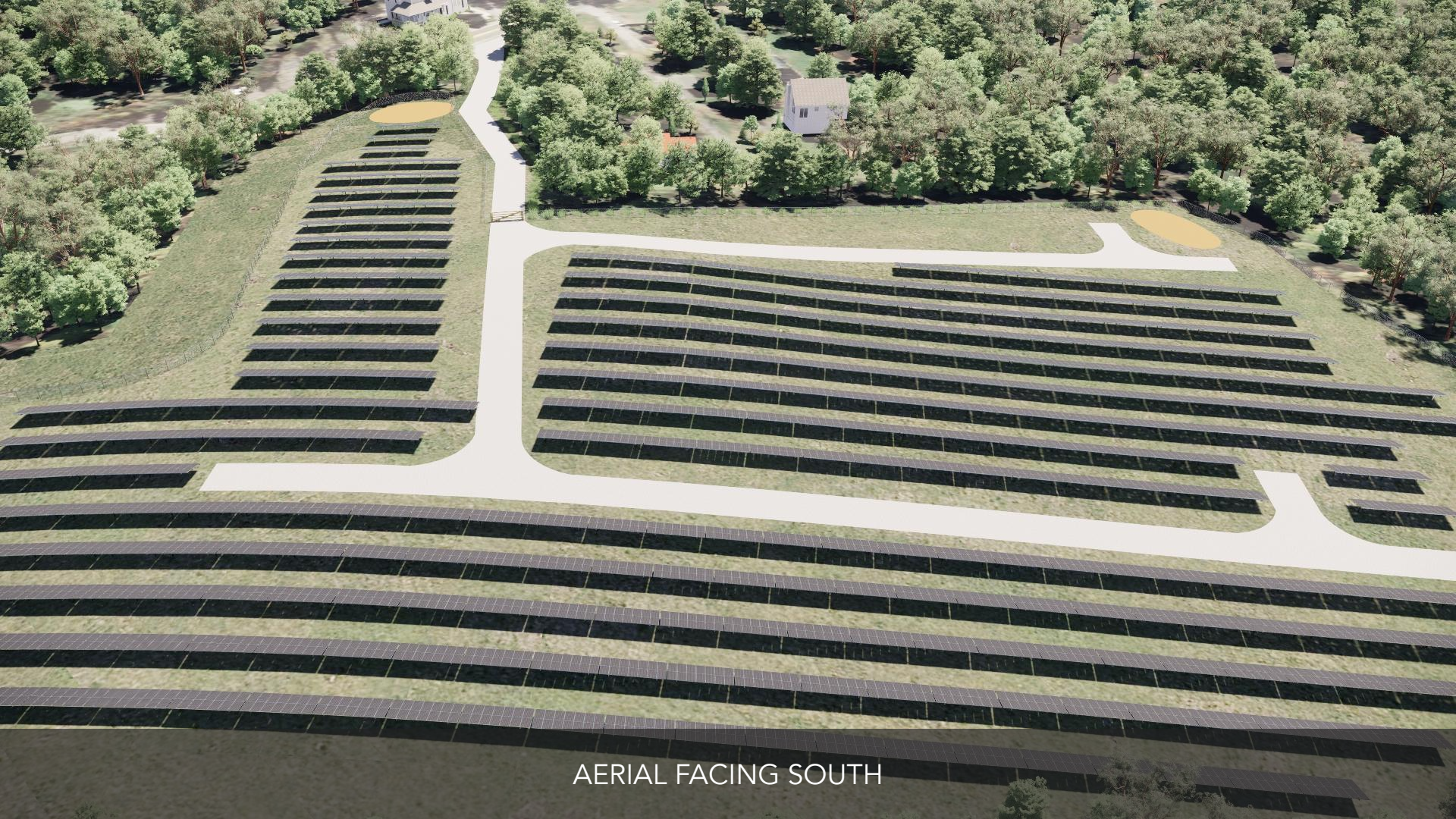
AERIAL FACING SOUTH