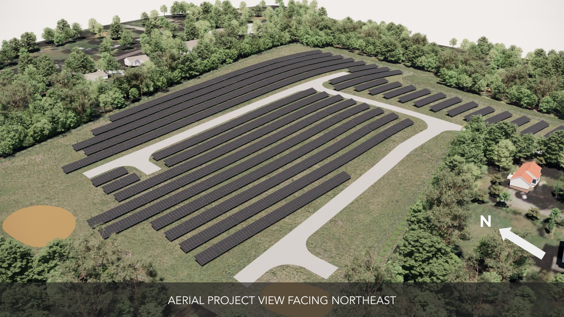
AERIAL PROJECT VIEW FACING NORTHEAST