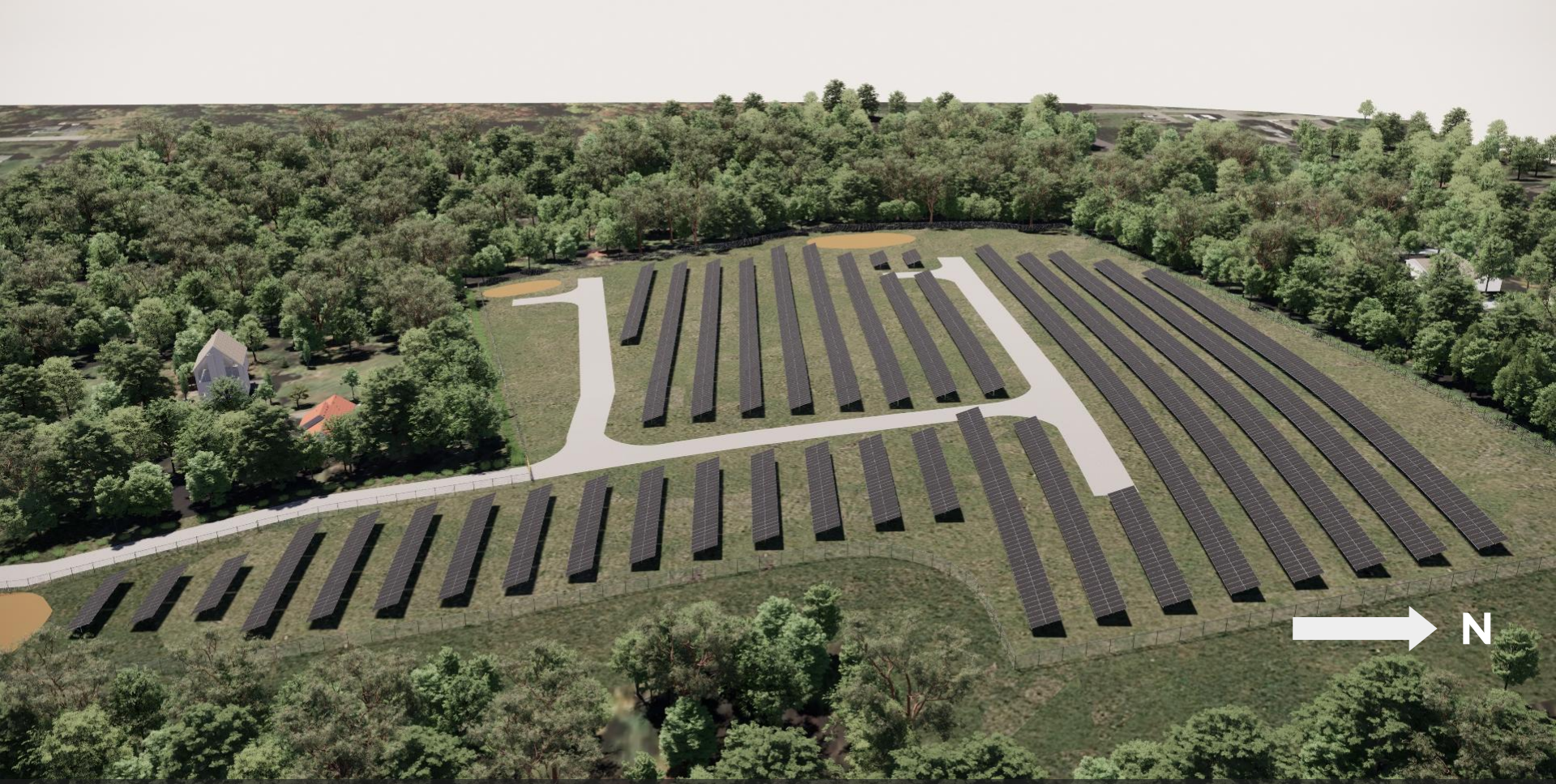
AERIAL PROJECT VIEW FACING WEST