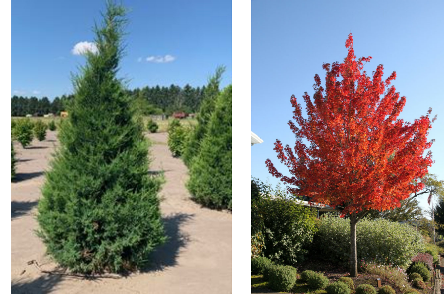
Juniperus virginiana Acer rubrum