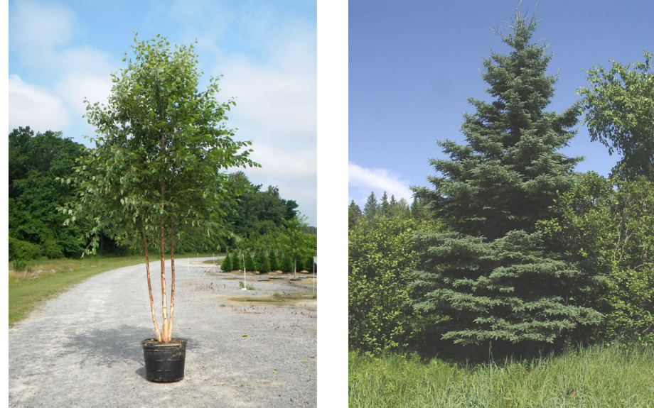
Betula nigra 'Dura Heat' Picea glauca