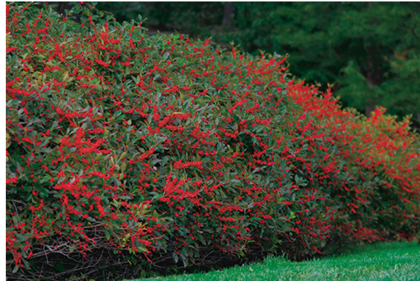
Ilex verticillata 'Winter Red'