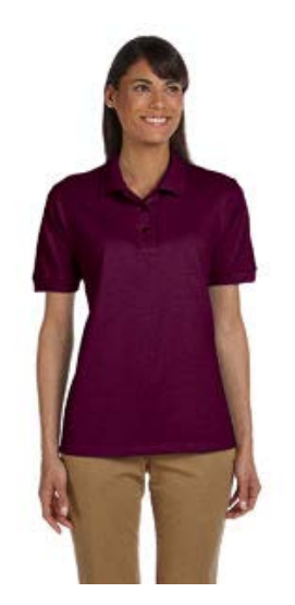
Bid No. PL-4

_____ ADULT SMALL-X-LARGE (LADIES) AMOUNT PER SHIRT IN WORDS: _____