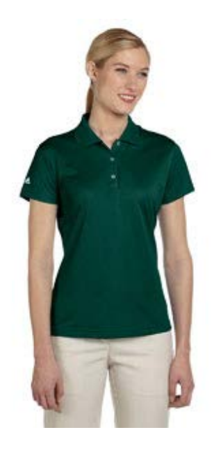
Bid No. PL-3

SHIRT: LADIES ADIDAS CLIMALITE A131 5.1 OZ. 100%