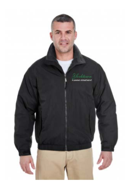
Bid No. PL-5

SHIRT: ULTRA CLUB 8921, ADULT ADVENTURE ALL-WEATHER JACKET EMBROIDER: "TOWN OF YORKTOWN PLANNING DEPARTMENT" LEFT CHEST