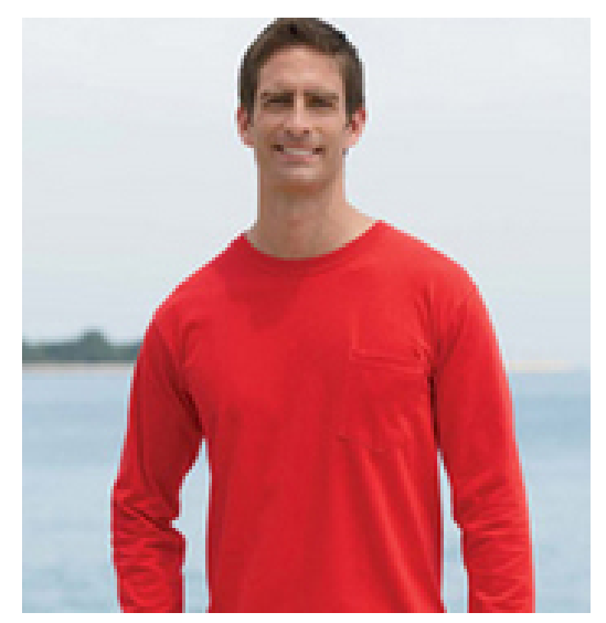
Bid No. <u>B-2</u>

SHIRT: GUILDEN DRY BLEND 50/50 LONG SLEEVE SHIRT with