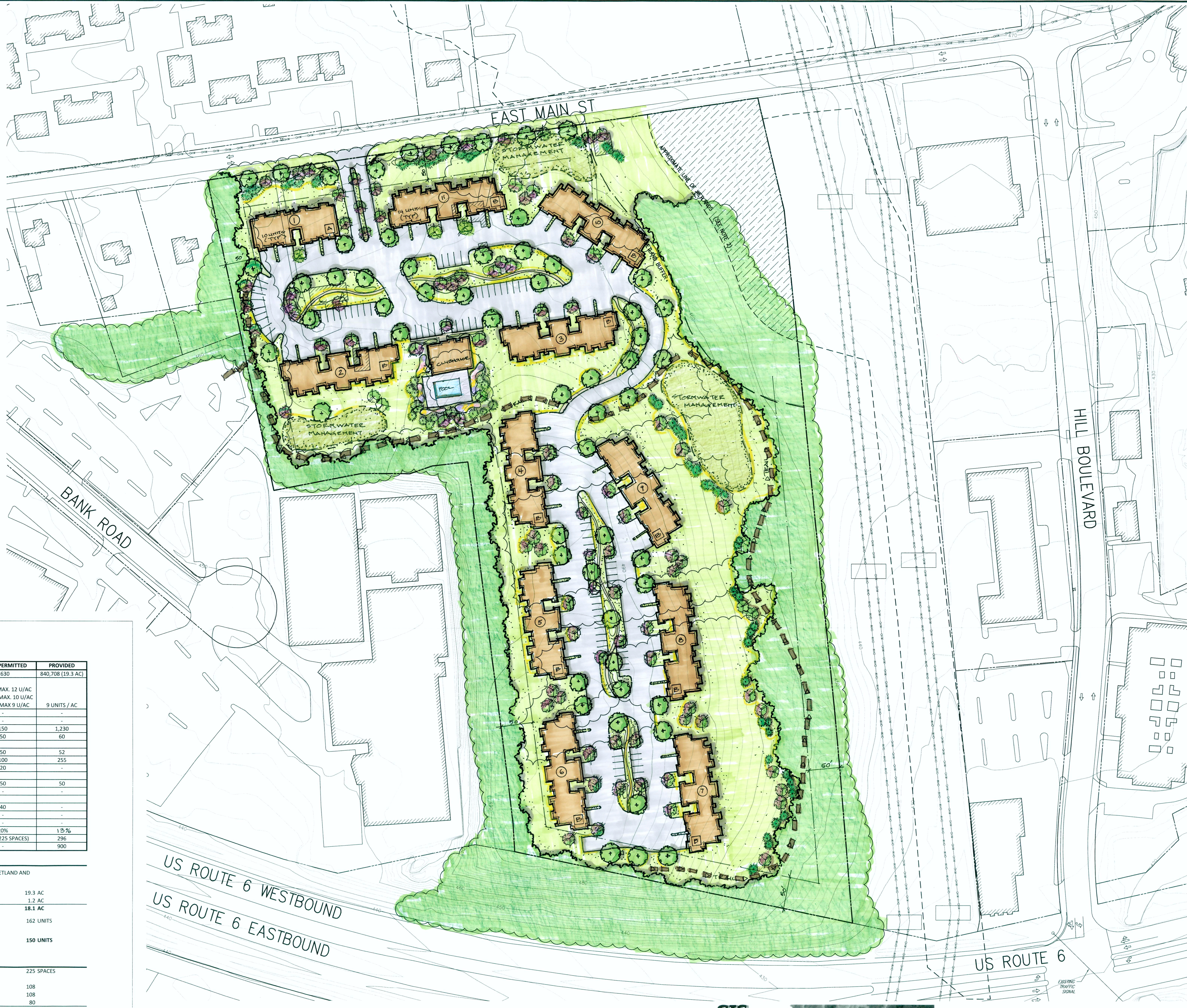
TABLE OF LAND USE - SITE PLAN

NOTES: EXISTING BASE INFORMATION TAKEN FROM WESTCHESTER COUNTY G.I.S. SYSTEM. EXISTING WETLAND INFORMATION TAKEN FROM EXHIBIT 2 "WETLANDS" FIGURE AS PART OF THE "HILL PROPERTY AND COMPREHENSIVE PLAN ANALYSIS" AS PREPARED BY SACCARDI & SCHIFF, INC., DATED SEPTEMBER 1, 2005.