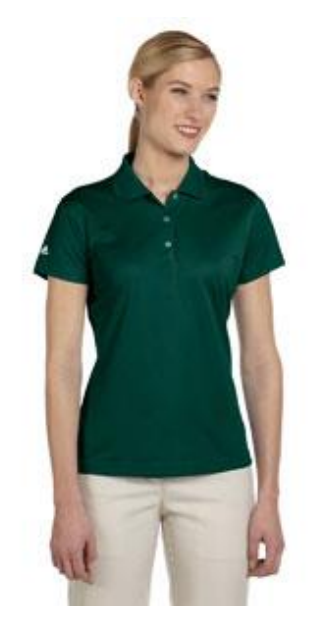
Bid No. PL-3

ADULT MEDIUM-X-LARGE AMOUNT PER SHIRT IN WORDS: _____