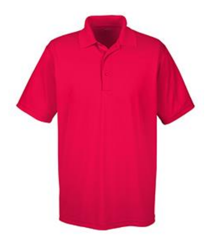
Bid No. <u>S-1</u>

SHIRT: ULTRA CLUB STYLE 8610 COOL 8 STAR ELITE PERFORMANCE