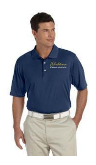
Bid No. PL-2

SHIRT: ULTRA CLUB STYLE 8610 COOL 8 STAR ELITE PERFORMANCE