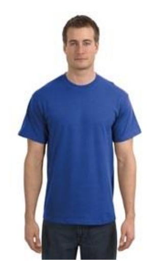
Bid No. <u>S-2</u>