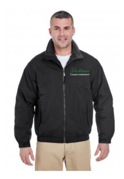
Bid No. <u>PL-5</u>

PRICE: AS-XL (LADIES) AMOUNT PER SHIRT IN WORDS: _____