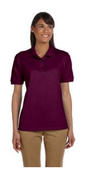
Bid No. PL-4

SHIRT: GILDAN G380L LADIES 100% 6.5 OZ. COTTON PIQUE POLO