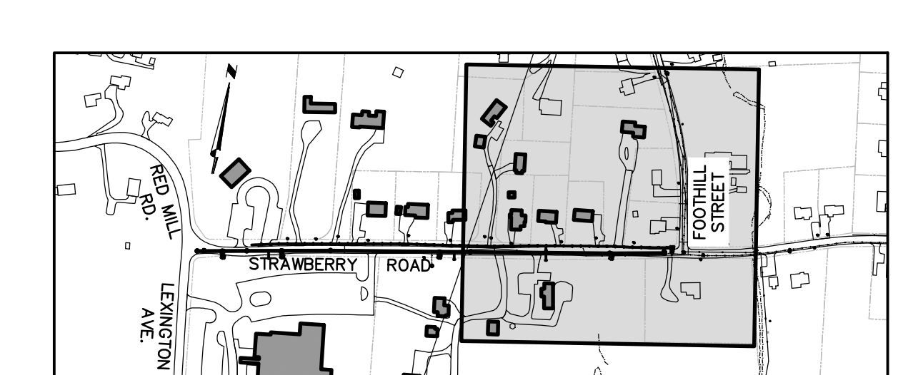
KEY PLAN - STRAWBERRY ROAD